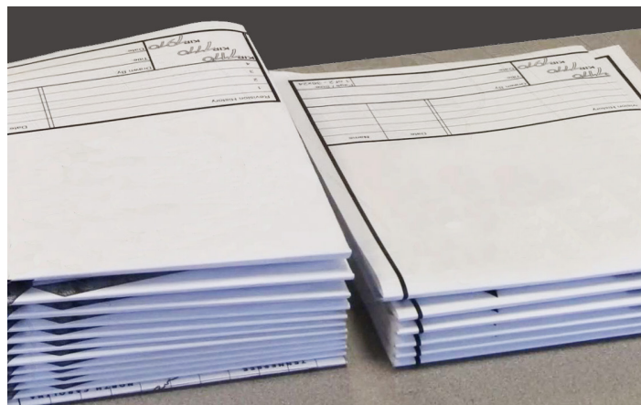
Portrait Packet Styles