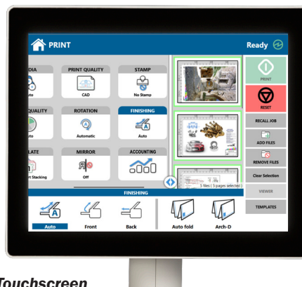
KIP Smart Touchscreen