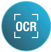
Optical Character Recognition

Higher Duty Cycles and Periodic Maintenance Intervals provide greater volume with fewer routine service calls so you can stay focused on productivity.